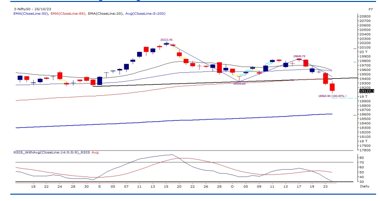
Exhibit 1: Nifty Daily Chart

In falling markets, it is advisable to exercise caution, as they can be quite unforgiving, and it's often not wise to attempt to identify support levels unless there are clear reversal signals. Additionally, it's essential to maintain vigilance regarding geopolitical factors, as they have the potential to exert a significant impact on market trends.