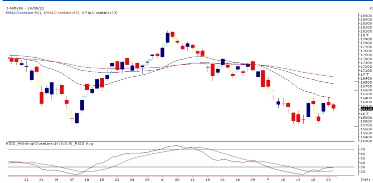
Exhibit 1: Nifty Daily Chart

Looking at the recent development, 16400 is expected to act as an intermediate resistance zone, followed by the sturdy wall of the unfilled gap of 16480-16650 odd zone. On the contrary, the 16000 mark is expected to act as the sheet anchor, while any breach below could again dampen the market sentiments. The momentum is likely to be seen only when the index comes out from the ongoing slender range bound movement. Till then, traders are advised to stay abreast with the global developments and have a stock-centric approach to trading opportunities.