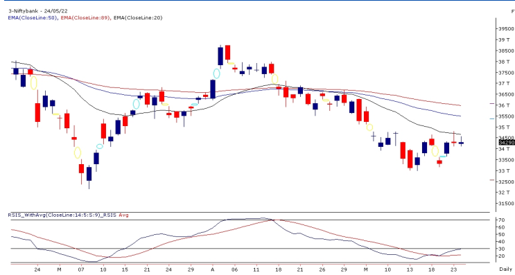
Exhibit 2: Nifty Bank Daily Chart

Looking at the recent development, 16400 is expected to act as an intermediate resistance zone, followed by the sturdy wall of the unfilled gap of 16480-16650 odd zone. On the contrary, the 16000 mark is expected to act as the sheet anchor, while any breach below could again dampen the market sentiments. The momentum is likely to be seen only when the index comes out from the ongoing slender range bound movement. Till then, traders are advised to stay abreast with the global developments and have a stock-centric approach to trading opportunities.