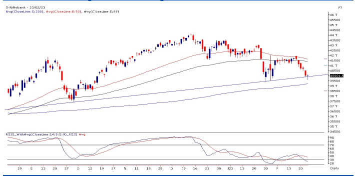
Exhibit 2: Nifty Bank Daily Chart