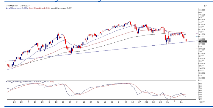
Exhibit 2: Nifty Bank Daily Chart