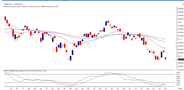
Exhibit 1: Nifty Daily Chart

At this juncture, it's better to take one step at a time. As far as levels are concerned, 16000 – 16100 once again becomes a sturdy wall and till the time, it does not get surpassed, we are likely to see selling pressure at higher levels.