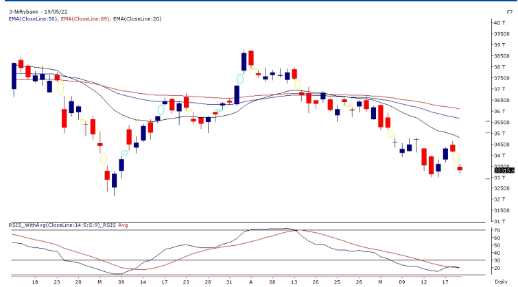
Exhibit 2: Nifty Bank Daily Chart