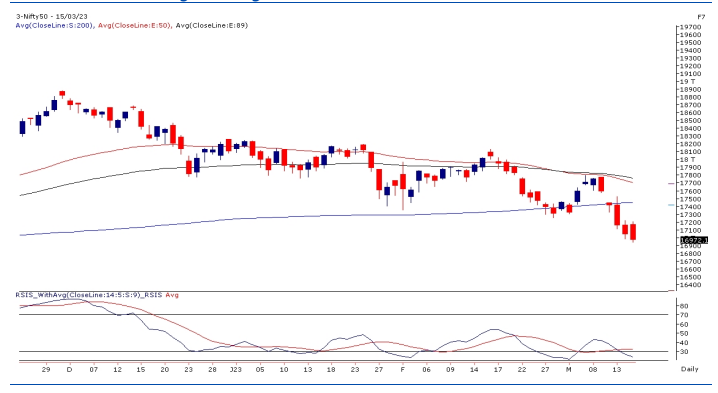
Exhibit 1: Nifty Daily Chart

Considering the price action, our market looks bleak but at the same time a bit oversold too. We advocate not to comply with the ongoing sell-off and wait for some positive triggers to levitate the markets. Meanwhile, one should keep a close tab on the mentioned levels and avoid aggressive bets for the time being. Simultaneously, stay abreast with global developments.