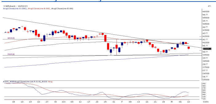
Exhibit 2: Nifty Bank Daily Chart

The weak global cues and underperforming heavyweights (especially Reliance) were the major culprits in dragging our markets down. Going ahead, it would be crucial to keep a close tab on them as any positive development globally, can elevate the overall sentiments. Also, Nifty Midcap 100 outperformed as this index ended the week in green, forming a 'hammer' pattern around the recent trend line breakout levels. If the markets find some relief, we may see many midcap counters giving mesmerizing moves. Traders are advised to focus on such counters that are likely to provide better trading opportunities.