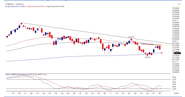
Exhibit 1: Nifty Daily Chart

The weak global cues and underperforming heavyweights (especially Reliance) were the major culprits in dragging our markets down. Going ahead, it would be crucial to keep a close tab on them as any positive development globally, can elevate the overall sentiments. Also, Nifty Midcap 100 outperformed as this index ended the week in green, forming a 'hammer' pattern around the recent trend line breakout levels. If the markets find some relief, we may see many midcap counters giving mesmerizing moves. Traders are advised to focus on such counters that are likely to provide better trading opportunities.