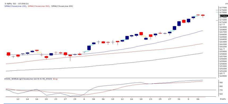
Exhibit 1: Nifty Daily Chart

Going ahead, 17450 is to be seen as immediate hurdle and the moment we close below 17300 , we would see some immediate profit booking in the market. Hence, traders are advised to stay light and avoid taking aggressive bets for a while. Apart from the benchmark index, the banking space continues to sulk; but yesterday surprisingly, the IT basket was also applying some pressure, which could be the space to watch going ahead.