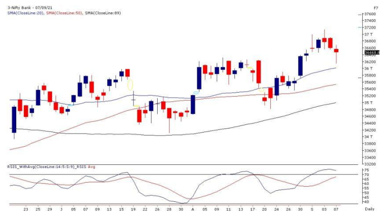
Exhibit 2: Nifty Bank Daily Chart