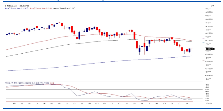
Exhibit 2: Nifty Bank Daily Chart