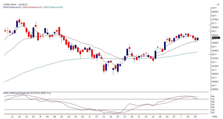
Exhibit 2: Nifty Bank Daily Chart

Yesterday, it was good to see the weakest link financial space outperforming the benchmark index. However, it is still not completely out of the woods yet. If BANKNIFTY has to regain the real strength, it needs to surpass the crucial intraday swing high of 35400 . If this happens then Wednesday's decline should be considered a running correction and going forward, 35800 – 36000 are the levels to watch out for. If it fails to do so and starts correcting below 34800 , this would be a sign of weakness. Hence, it is advisable to keep a tab on these mentioned levels and trade accordingly.